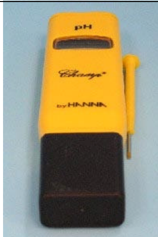
PW-HI98106 pH pen 0 - 14