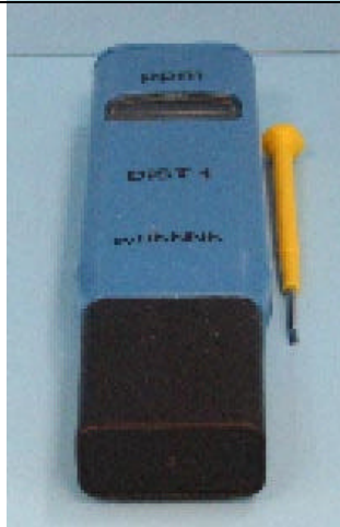
PW-HI98300 TDS/Conductivity pen 0 – 1999 ppm