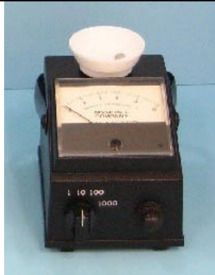
EP-10 Conductivity Meter 0 – 10,000 microS/cm